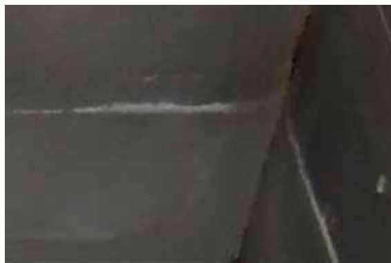
Picture 1: Etched stainless steel after only 3 weeks in service, without using Vulcan.

The installation of Vulcan 1000 and Vulcan 5000 solved this hard build-up problem successful.