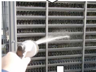
Water is hosed.