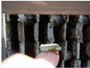
After the hosing