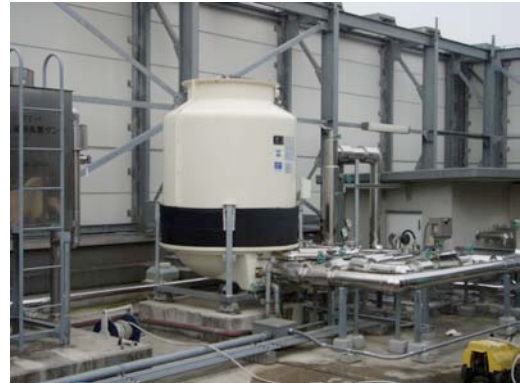
1 Cooling tower C