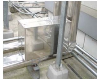
Used for the cooling towers A, B, and C

Vulcan installed on the makeup water piping (50A)