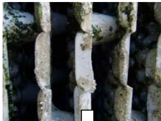
Adhesion of silica six month after the installation of the Vulcan