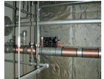
Used for the cooling towers C

Vulcan installed on the circulating piping (80A)