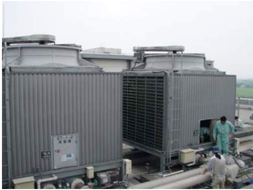
2.1 Cooling tower A 2.2 Cooling tower B