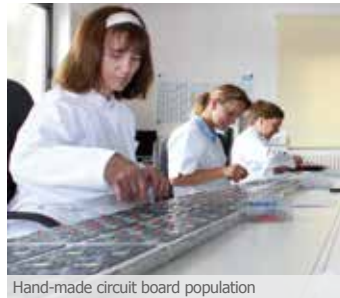
Hand-made circuit board population