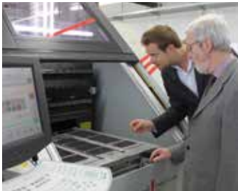
Specialized production of circuit boards