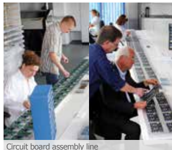
Circuit board assembly line