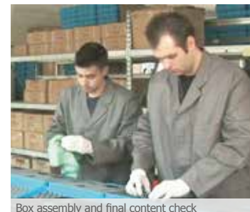
Box assembly and final content check

CWT – Christiani Wassertechnik GmbH Köpenicker Str. 154 10997 Berlin Germany