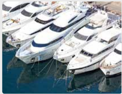
Yachts in a harbour.

Vulcan water treatment is the eco-friendly and salt-free solution to prevent scale and corrosion on yachts.