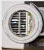
Swimming pool filter