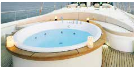
Jacuzzi on the deck of a luxury yacht.