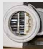
Swimming pool filter