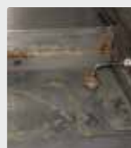
Grill plate in a restaurant